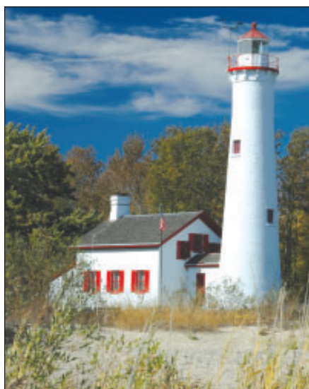
Sturgeon Point Lighthouse