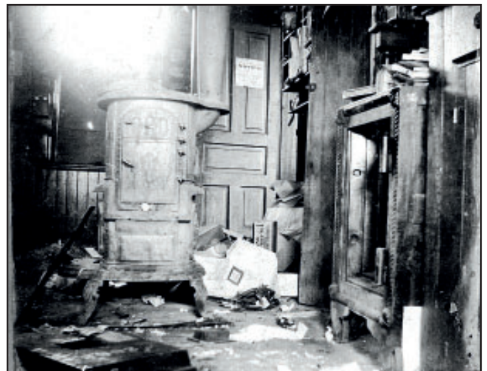
D&M Railway safe blown open, note the safe door on the floor lower left side.

This is the fourth burglary to occur in this vicinity within a short time. It will afford great satisfaction to the citizens if the officers succeed in landing some of the guilty parties.