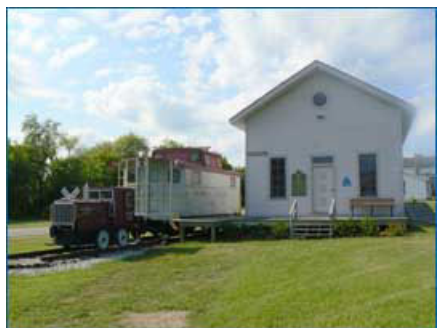
Lincoln Train Depot